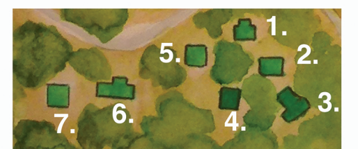
1. Fair Village Cabins