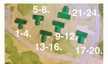
5. Family Life Center