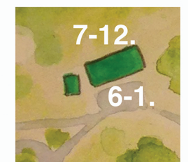
18. Smith Dorm